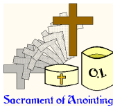
Sacrament of Anointing