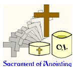
Sacrament of Anointing