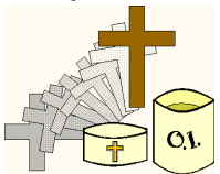
Sacrament of Anointing