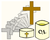
Sacrament of Anointing