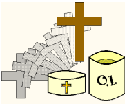
Sacrament of Anointing