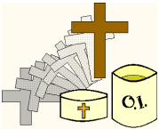
Sacrament of Anointing