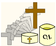
Sacrament of Anointing