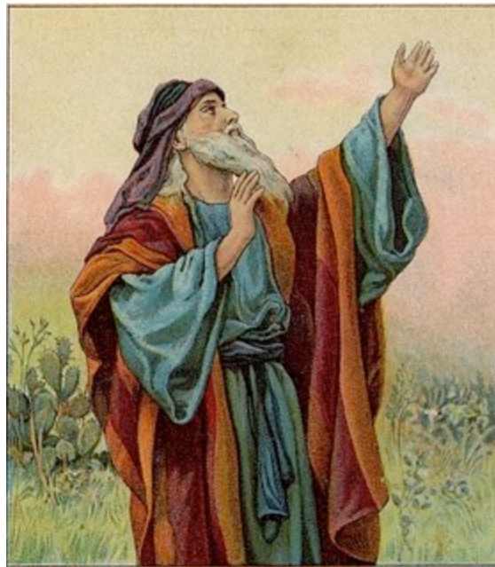
A picture of prophet Isaiah